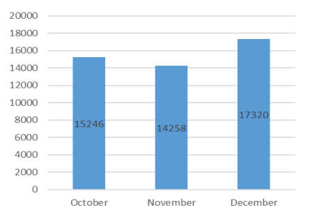
Figure 1. Unique phishing sites detected Oct.-Dec. 2014 [2].

The mechanisms of protecting the user's computer against malwares and spoofed emails will never give a full guarantee of solving the problem of phishing attacks; the best phishing detection algorithms still have an error rate not less than 7%. [1]