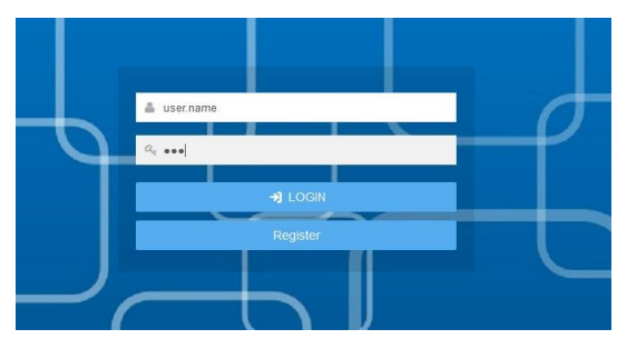
Figure 4. website login page.

Figures 4, 5, and 6 show screenshots of the authentication process, Figure 4 shows the website login page where the user enters his credentials, figure 5 depicts the waiting message displayed on the user's browser until he completes the authentication from his mobile, Figure 6-a shows the login notification that appears on the user's mobile application upon the arrival of the notification message, in this notification the user decides whether to authenticate the session or reject it.