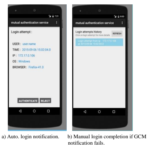
Figure 6. Login Notification.

Protocol fall-back mechanism: Our authentication protocol can fall back to user's credentials only scheme in case the user's mobile is not compatible or inaccessible at the time of authentication. To the traditional password strengthen based fall-back authentication, the mechanism is supplemented by an SMS-based or email-based OTP that is delivered to the user to enter it in